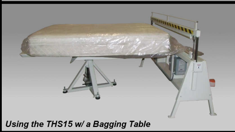
Using the THS15 w/ a Bagging Table